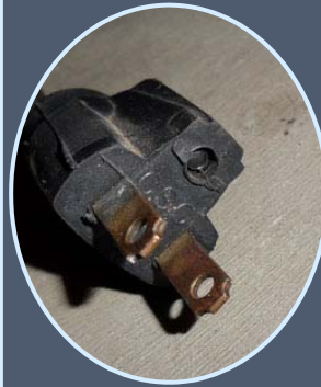
Missing 3 rd grounding prong