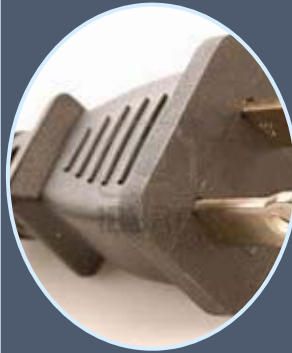
Broken / bent prongs