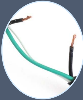
Damaged insulation (exposed wiring)