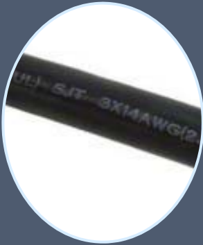
Pinched outer jackets