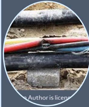
Damaged insulation on a power or extension cord

If any of these conditions exist, do not use the cord or equipment.