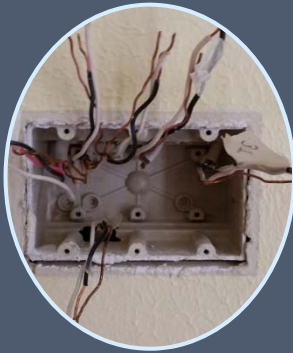
Missing or damaged outer jackets